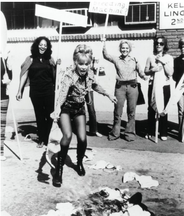
Bra-burning protest in 1970s USA

He wrote at a time when most people had shared values and before the advent of many of the rapid technological and social changes which followed industrialisation. His work was developed further by Talcott Parsons, Robert Merton and the so-called 'March of Progress' thinkers. Some of these ideas arguably laid the foundations for New Right thinking today, which applies some aspects of conservative and traditional ideas to the wider society (e.g. believing that gender roles are based on biological functions).