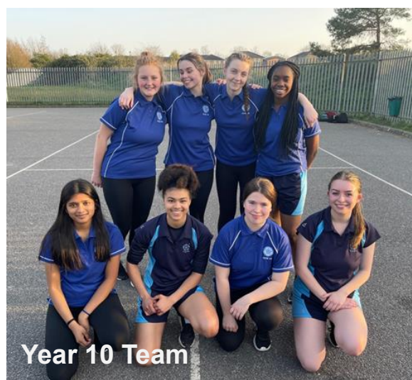
Year 10 Team