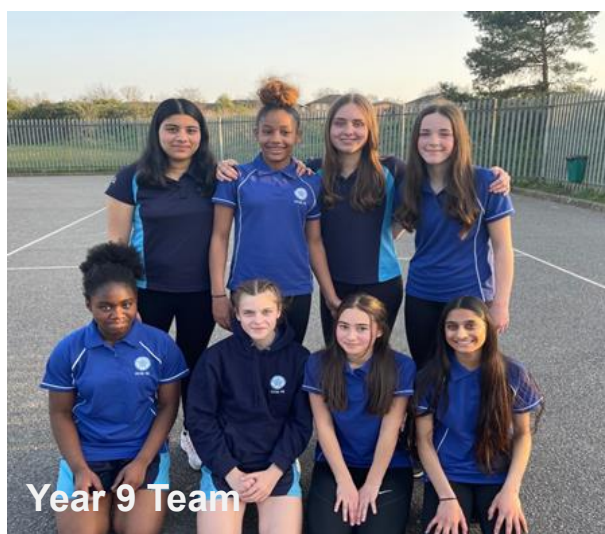
Year 9 Team

The Year 10s have also had another successful season in the same Sutton league, they won majority of their games and only lost to Cheam. The year 10s came 2 nd overall just missing out on the trophy! Well done for another successful season of Netball, you have been amazing!