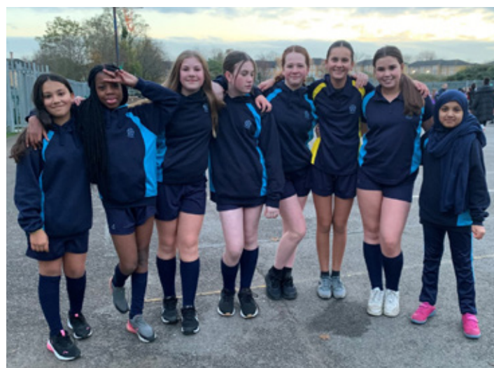
First place for Year 7 in the borough netball tournament for us!