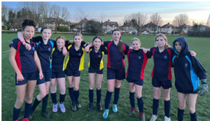
Year 7 football team starting their Sutton league campaign with a 2-1 win!