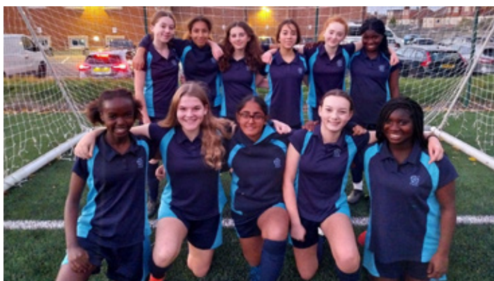
Year 9 football team starting their Sutton Cup campaign!