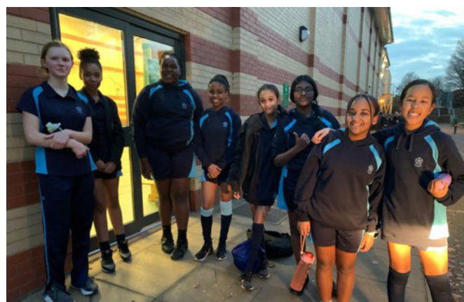
Second place for Year 8 in the borough netball tournament.