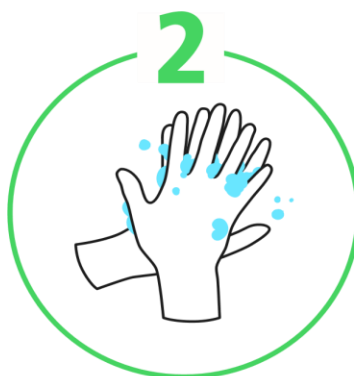
The backs of hands