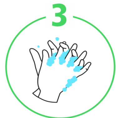
In between the fingers