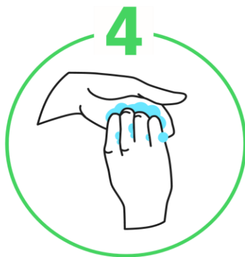
The back of the fingers