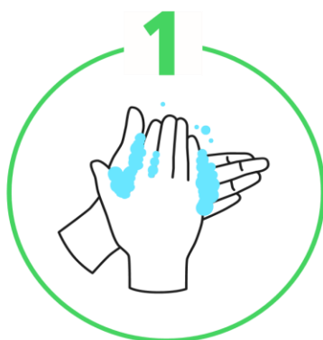
Palm to palm

Wash your hands with soap and water more often for 20 seconds