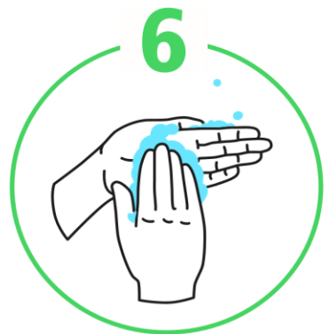
The tips of the fingers

Use a tissue to turn off the tap. Dry hands thoroughly.